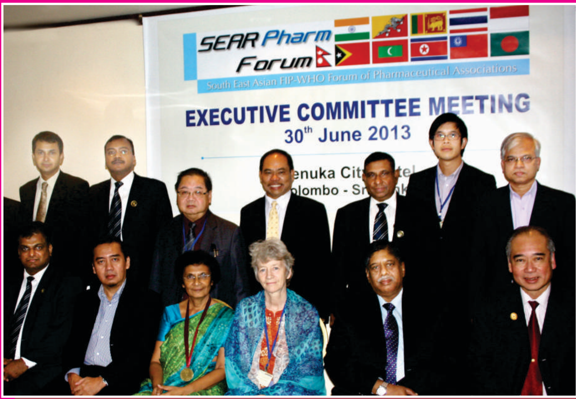
Executive Committee (2012-14)